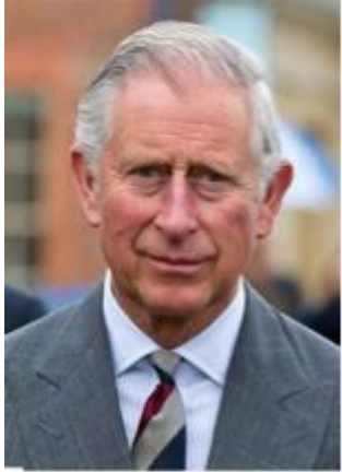
HM King Charles III