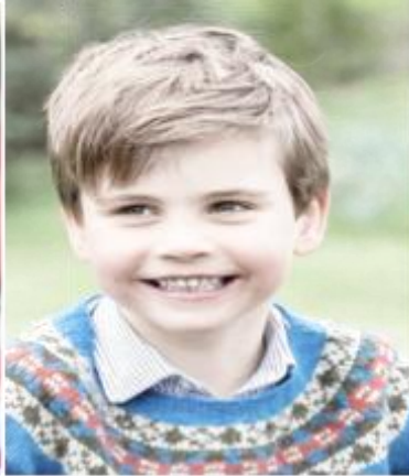
Prince Louis of Wales