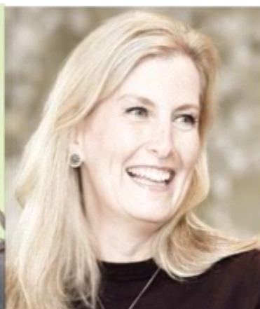
Sophie Duchess of Edinburgh