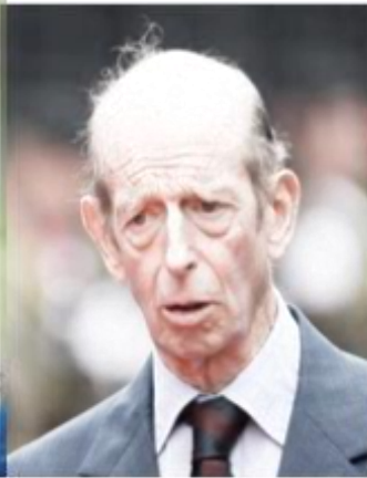
Duke of Kent