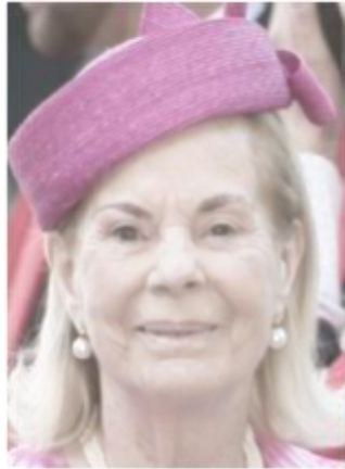
Duchess of Kent