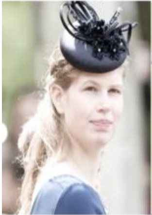
Lady Louise Windsor