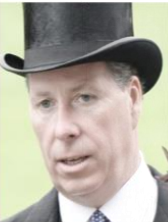
David Armstrong- Jones (Lord Snowden)