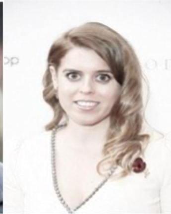
Princess Beatrice of York