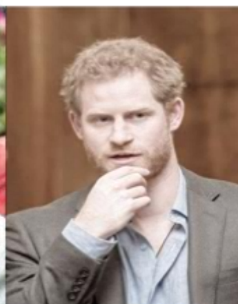
Prince Harry Duke of Sussex