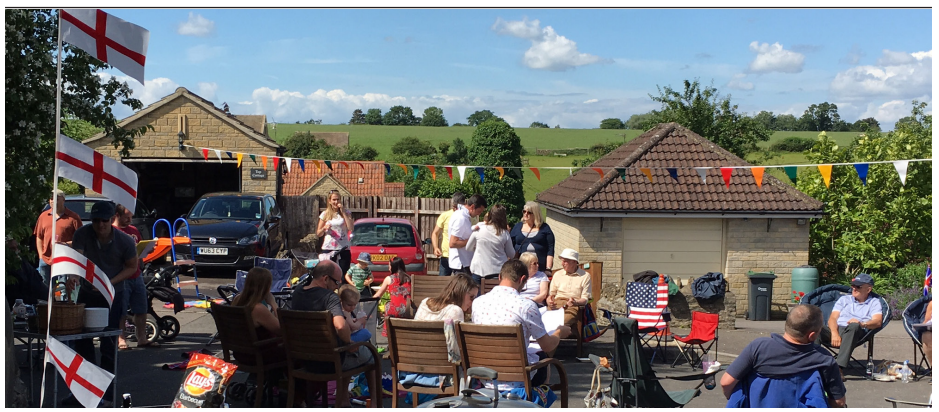
Burtonites gather on Tolldown Way to celebrate the Queen's 90th birthday