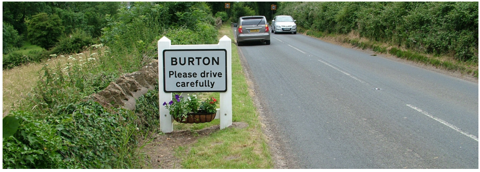
One of the new picket gates and planters on the east entrance to the village

The village appearance is much improved by Burton in Bloom, not only by this project, but also the work carried out on the Tidy Up days it organises.